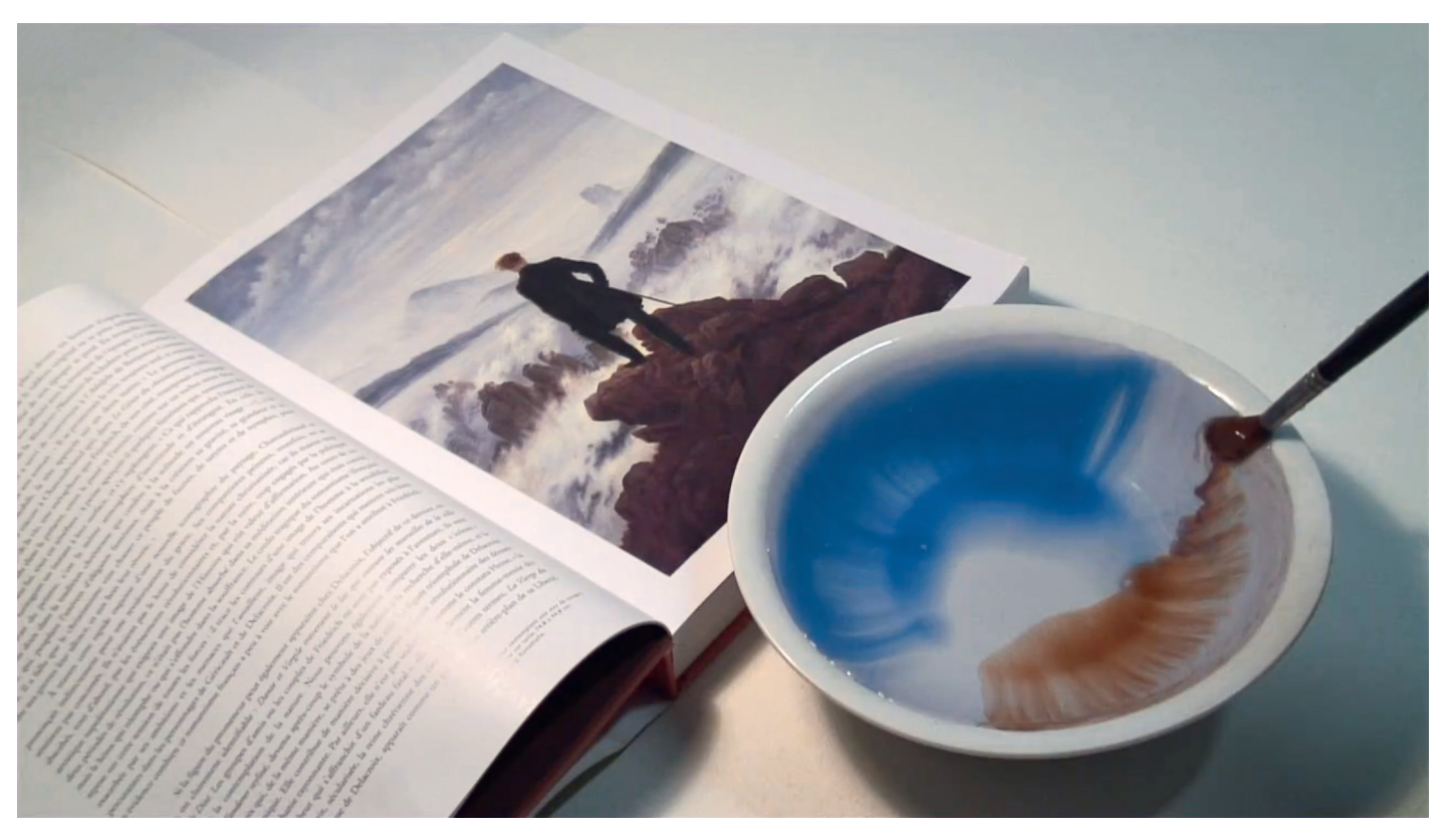
Sarkis, Film n°114, D'après Caspar Friedrich, "Voyageur contemplant une mer de nuages", 2006.