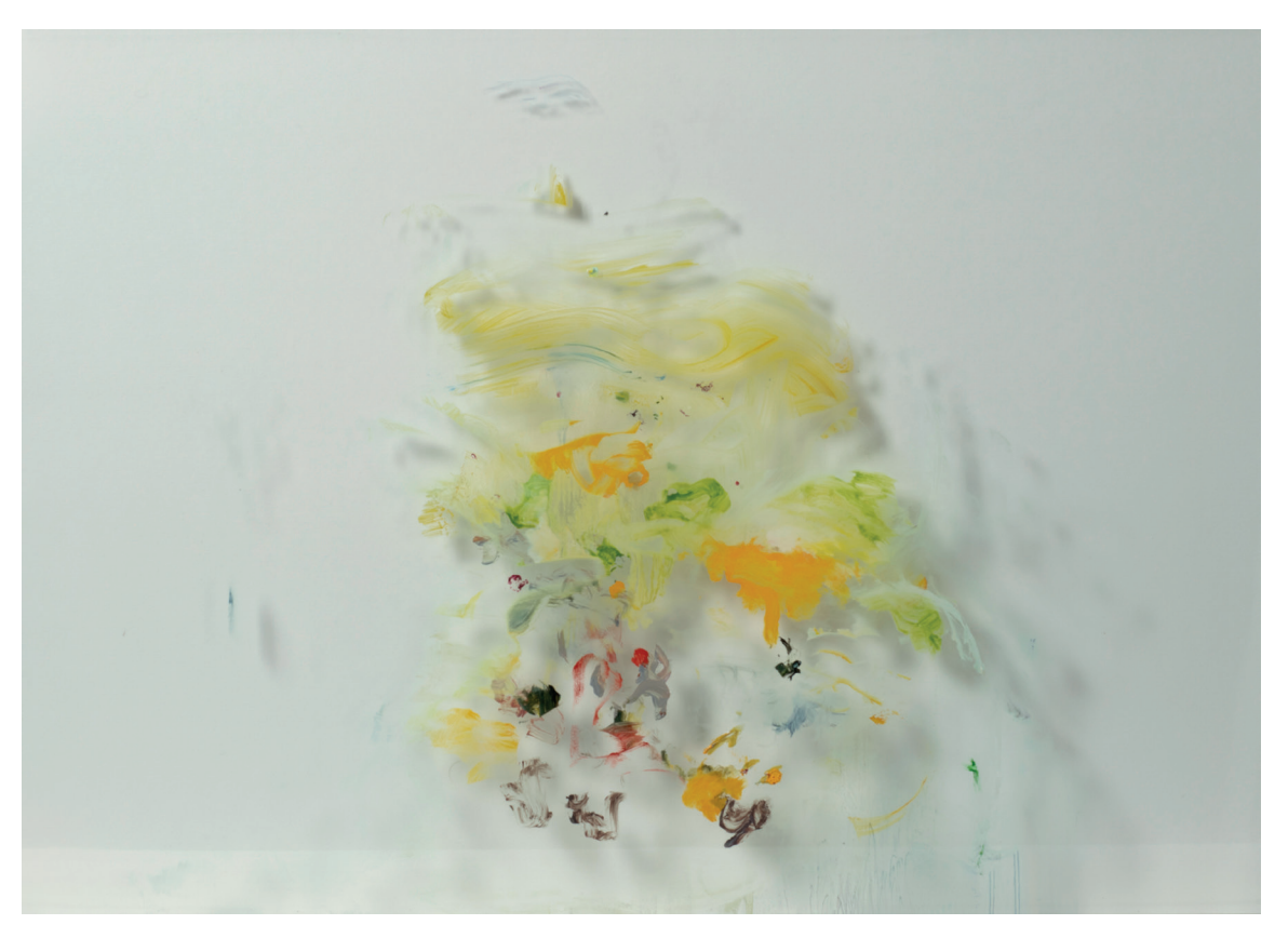
Angel Vergara, Courge, 2013. Courtesy of the artist and Axel Vervoordt Gallery. © SABAM Belgium, 2019. Photo: Philippe De Gobert

Fabrice Samyn, Burning is Shining, burned wood and gold leaf, 63.5 \times 51 cm, 2015-2016. Collection Renaud Samyn. Courtesy of the artist.