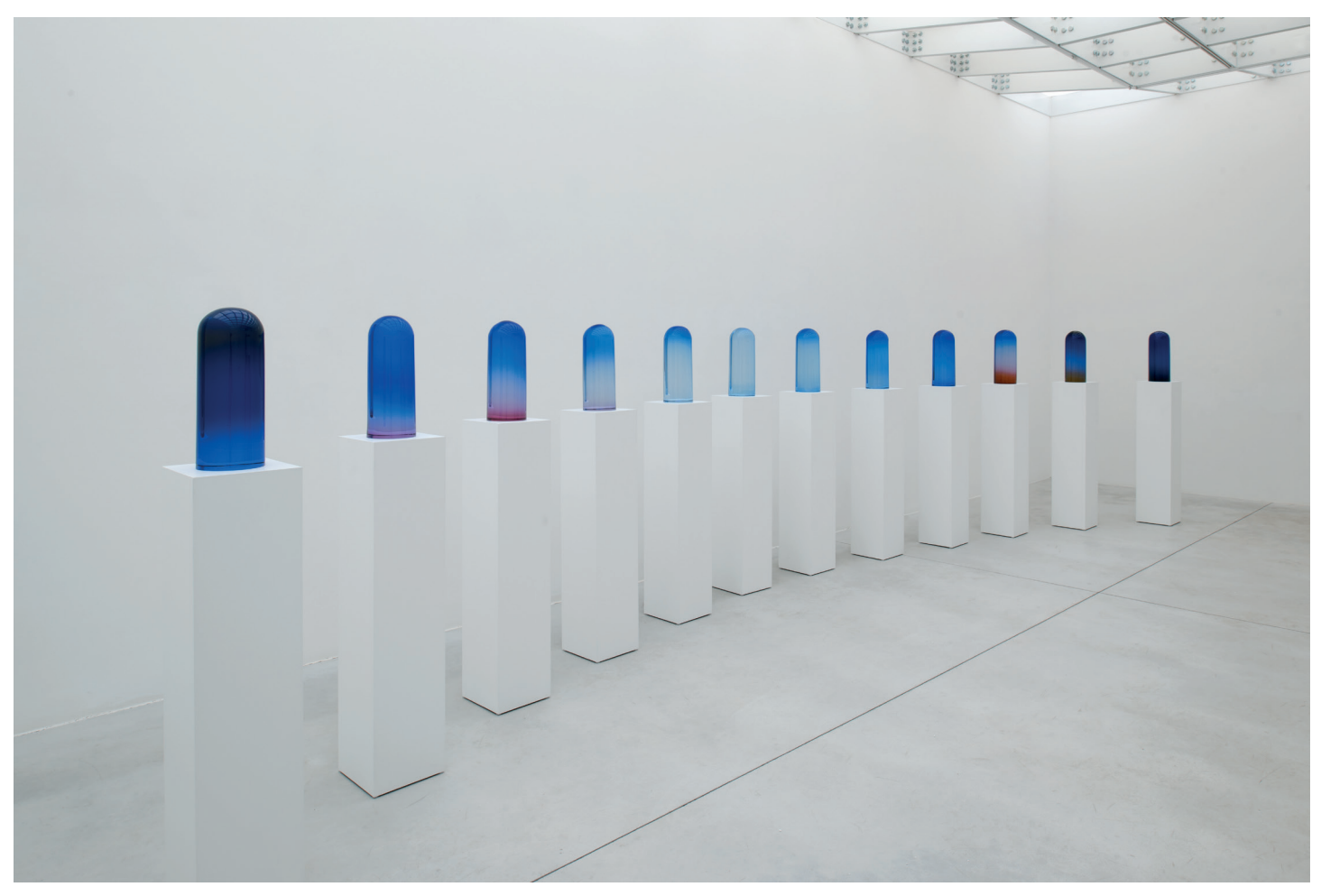
Fabrice Samyn, Untitled, 01 Apr 2016 (Color of Time), 2016. Collection Renaud Samyn.