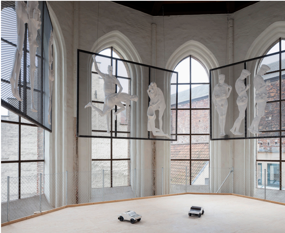
Exhibition view, As Sirens Rise and Fall , Kunsthall, Ghent 2021.

take on the shape of a vulva and the yellow neon lights that describe jets of urine (golden shower) confirm the allusion to non-normative, taboo sexual practices.