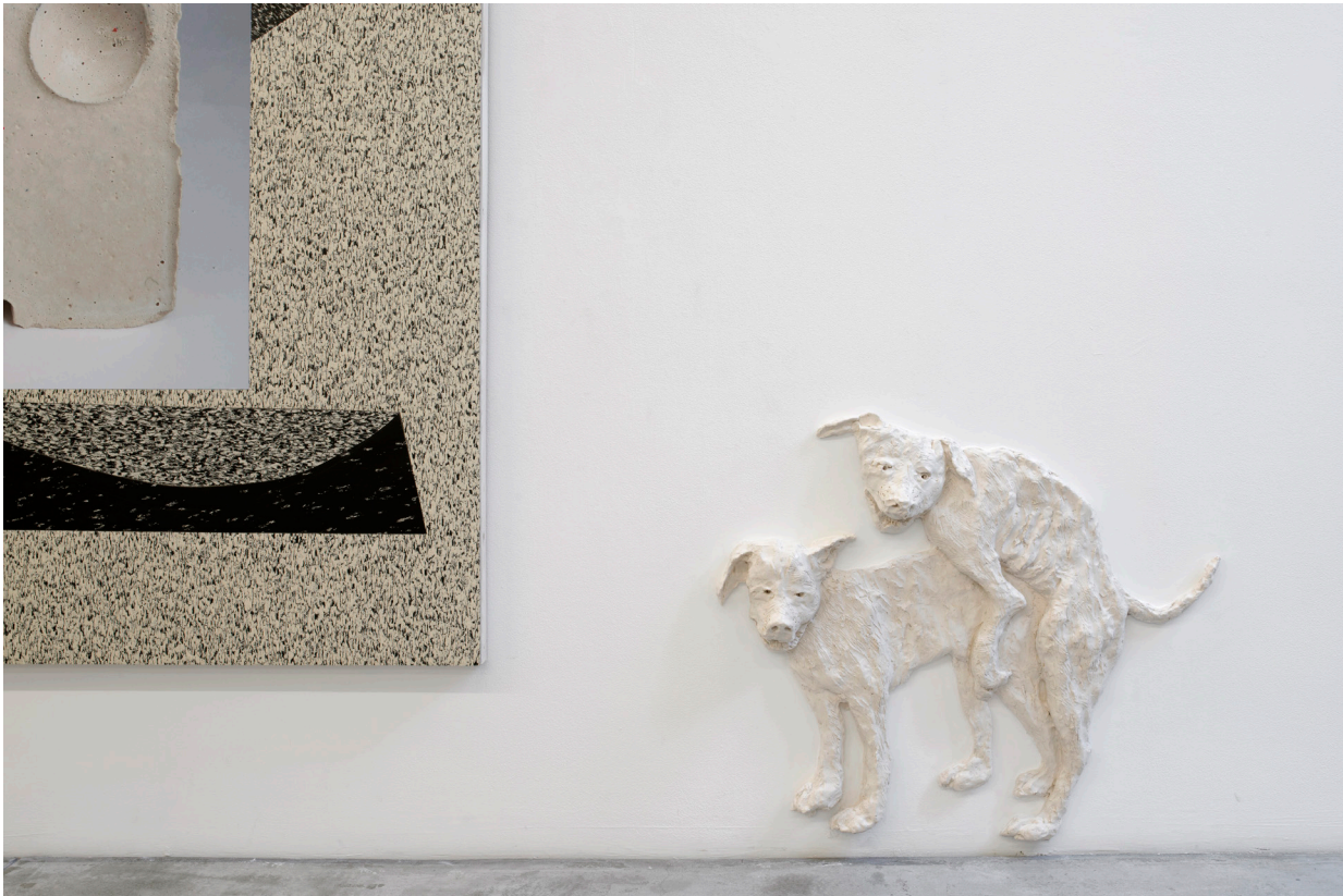
Exhibition views, Urine Mate , Galerie Baronian Xippas, Brussels, 2016.