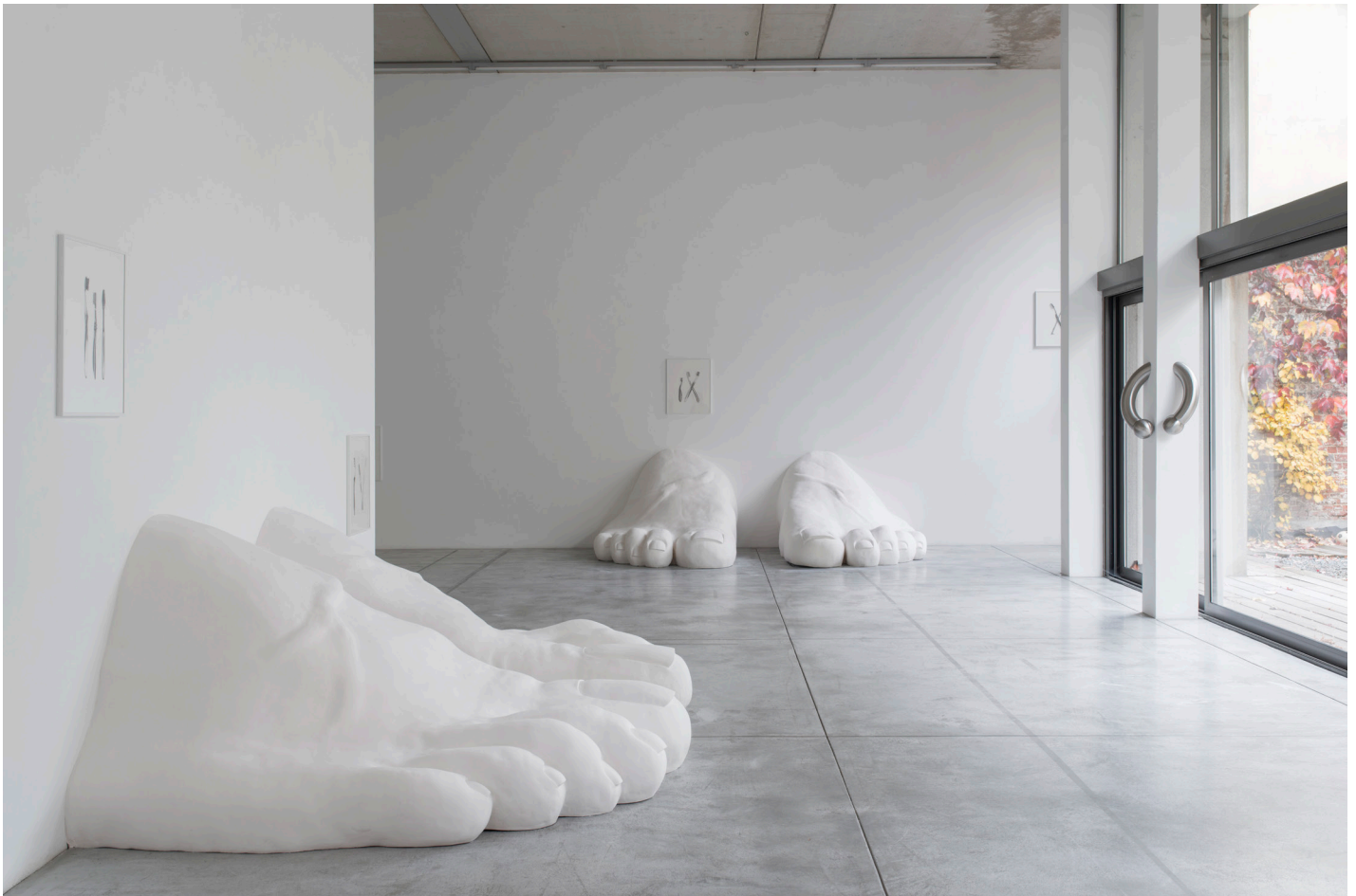
Exhibition view, Bastinado, Galerie Baronian Xippas, Brussels, 2018.