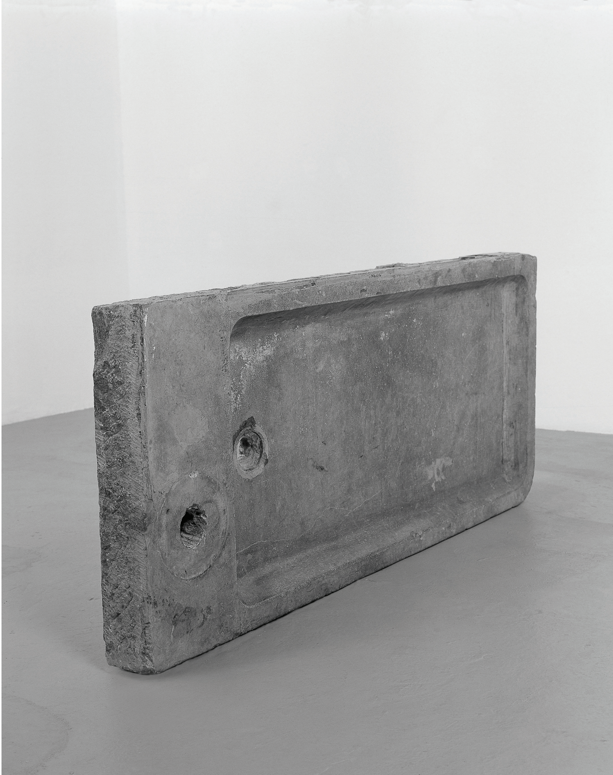
Maurice Blaussyld, Granit , 1998. Collection Musée des Arts Contemporains au Grand-Hornu, donated by the artist. Courtesy of the artist. Photo: Danièle Blaussyld

Finally, the exhibition would not have been complete without considering the inextricable ties between the visible and the invisible which have been woven by painting since time immemorial, and are highlighted here by Jean-Marie Bytebier's chiaroscuro landscapes and Angel Vergara's video paintings.