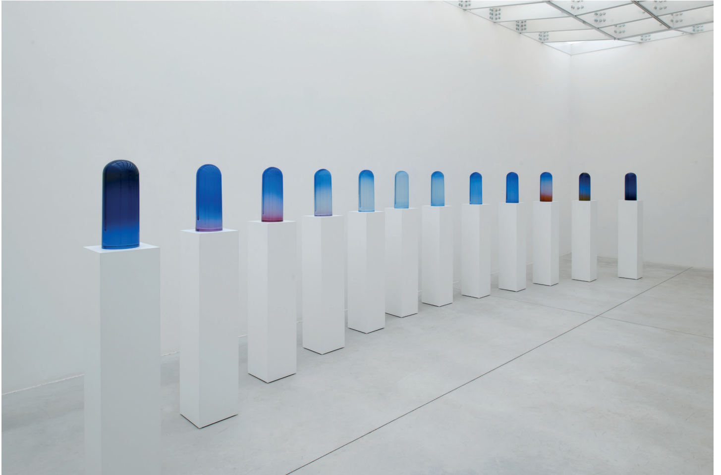
Fabrice Samyn, Untitled, 01 Apr 2016 (Color of Time) , 2016. Collection Renaud Samyn. Courtesy of the artist. Photo: Philippe De Gobert