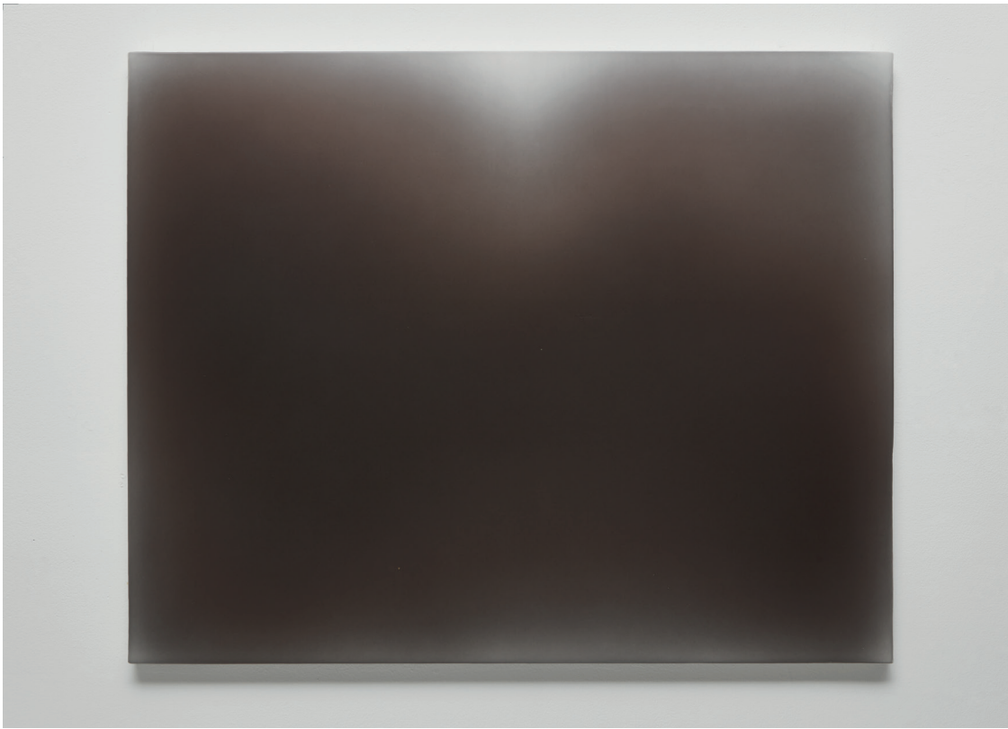
Daniel Turner, Untitled , 2019.