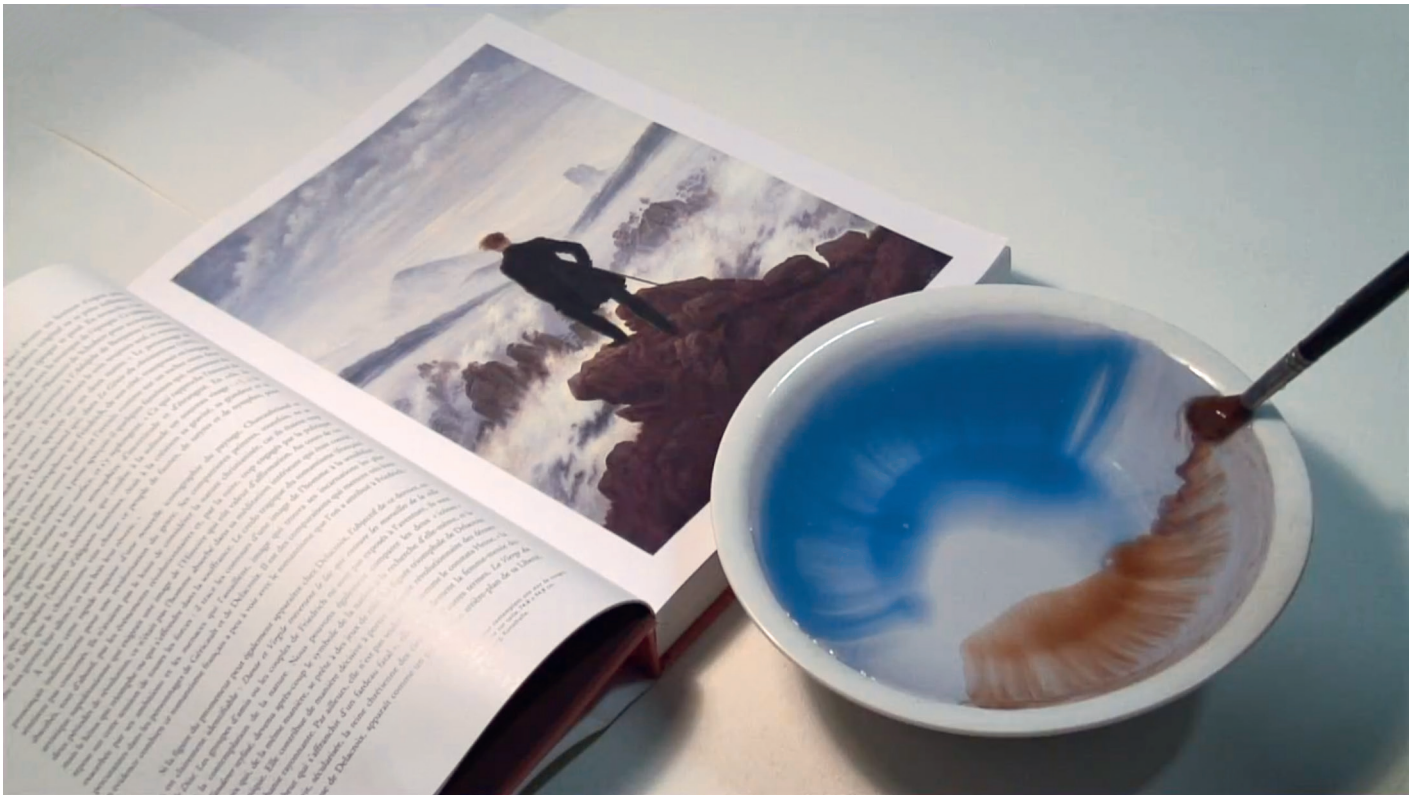
Sarkis, Film n°114, D'après Caspar Friedrich, "Voyageur contemplant une mer de nuages" , 2006.