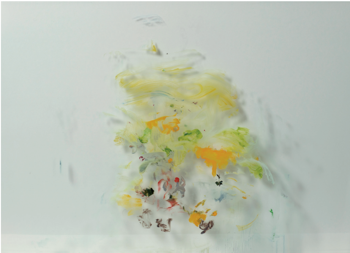
Angel Vergara, Course , 2013. Courtesy of the artist and Axel Verwoordt Gallery. © SABAM Belgium, 2019. Photo: Philippe De Gobert

Fabrice Samyn, Burning is Shining , burned wood and gold leaf, 63.5 x 51 cm, 2015-2016. Collection Renaud Samyn. Courtesy of the artist.